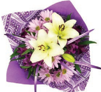
Thanks to Mom Bouquet