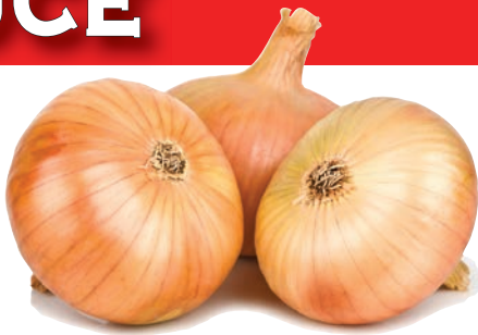
Sweet Yellow Onions 3 lb. bag