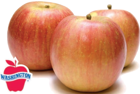
Fuji, Braeburn or Ambrosia Apples large