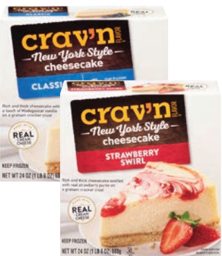
Crav'n Flavor New York Style Cheesecake classic or strawberry swirl 24 oz.