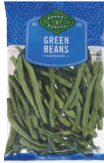
Basket & Bushel Green Beans 12 oz.