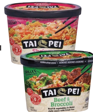
Tai Pei Entrees select varieties 9-11 oz.