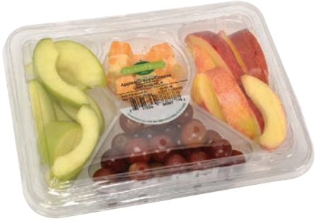
Del Monte Apple/Grapes/Cheese Tray 22 oz.