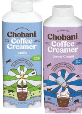
Chobani Coffee Creamer select varieties 24 oz.