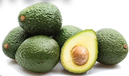
Hass Avocados jumbo