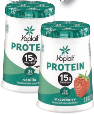
Yoplait Protein select varieties 5.6 oz.