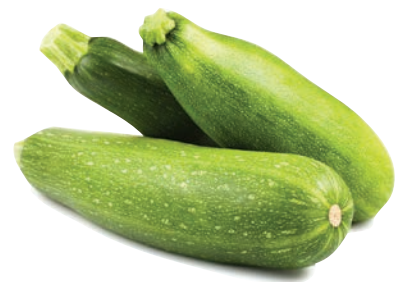
Mexican Grey Squash