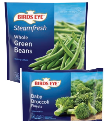
Birds Eye Vegetables select varieties 10-16 oz.