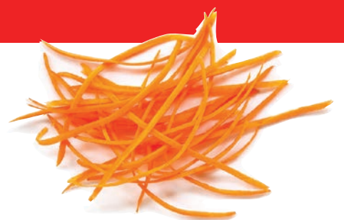
Matchstick Carrots 10 oz. pkg.