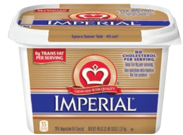
Imperial Spread 45 oz.