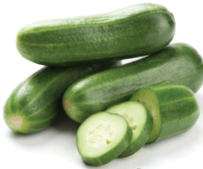
Mini Cucumbers 1 lb. bag