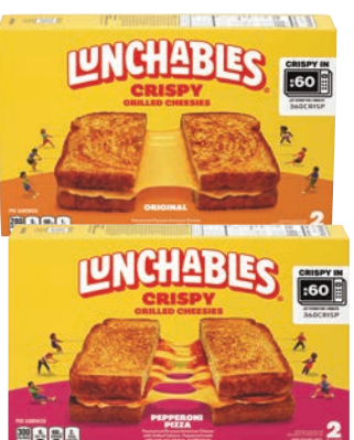
Lunchables Crispy Grilled Cheesies original or pepperoni pizza 5.71-6.2 oz.