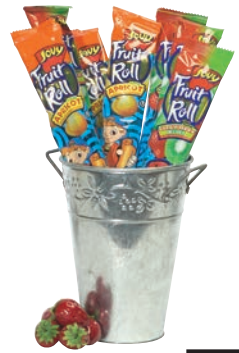
Jovy Fruit Rolls select varieties .75 oz.