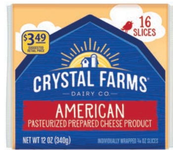
Crystal Farms American Singles p.p. $3.49 12 oz., 16 slices