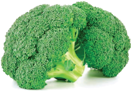
Broccoli garden fresh