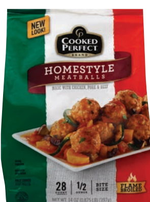
Cooked Perfect Homestyle Meatballs 14 oz.