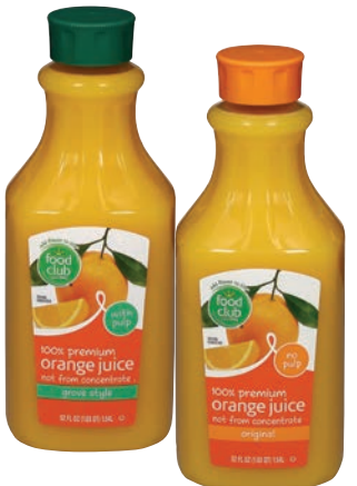
Food Club Orange Juice select varieties 52 oz.