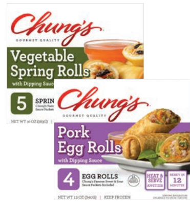
Chung's Spring or Egg Rolls select varieties 4-5 ct.